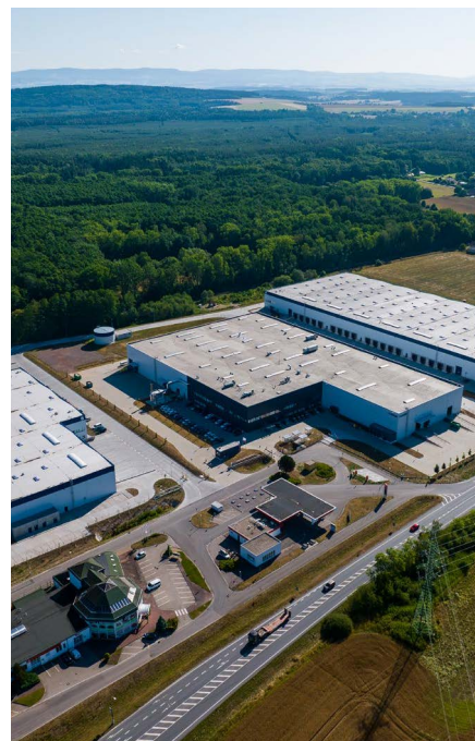
Logistic park Týniště II. a III.