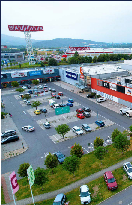
SC Géčko Liberec