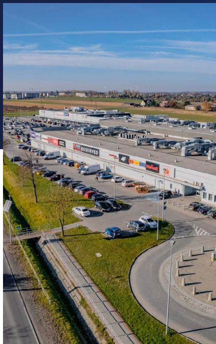
SC Ciechanów (PL)