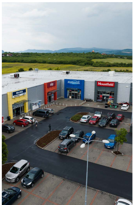
Most Retail Park