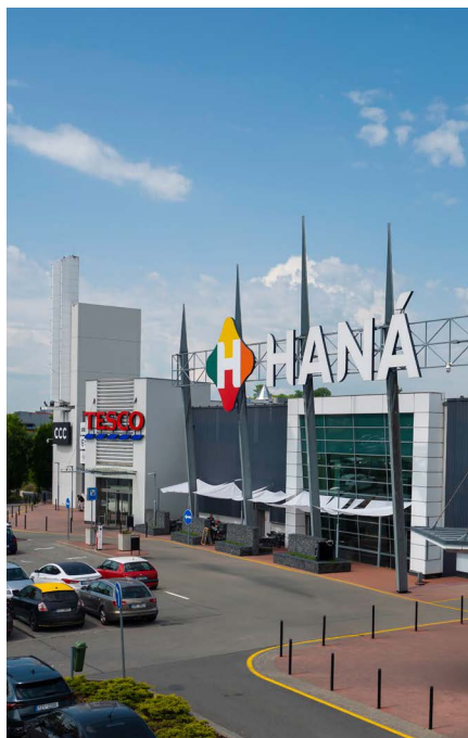
SC Haná Olomouc